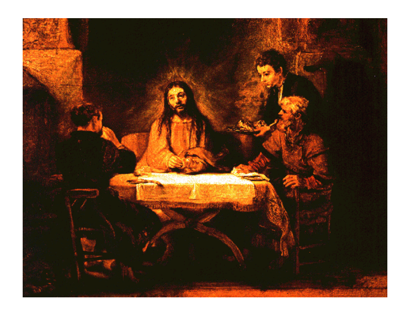
The Meal in Emmaus, by Rembrandt. Panel, 1648, Paris, The Louvre

Serra Club of South Palm Beach County 4770 Pine Tree Drive Boynton Beach, Fl 33436